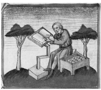
Fig. 5: Heinrich von Laufenberg, Regimen of Health (Regimen Sanitatis) , miniatures of the four temperaments, sanguine (fol. 61b), phlegmatic (fol. 62b), melancholic (fol. 63b), with the choleric missing, Staatsbibliothek zu Berlin – Preußischer Kulturbesitz, Handschriftenabteilung, MS germ. fol. 1191