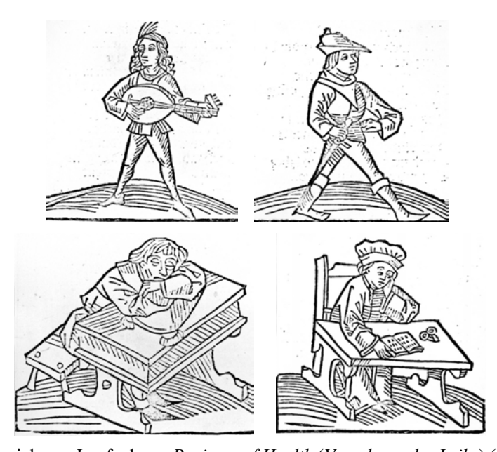
Fig. 6: Heinrich von Laufenberg, Regimen of Health (Versehung des Leibs) (Augsburg, bei Ratdolt, 1491): woodcuts of the four temperaments, sanguine (fol. f vi verso), choleric (fol. f viii recto), phlegmatic (fol. g i recto), and melancholic (fol. g ii recto), Wolfenbüttel, Herzog August Bibliothek, A: 167.9 Poet.