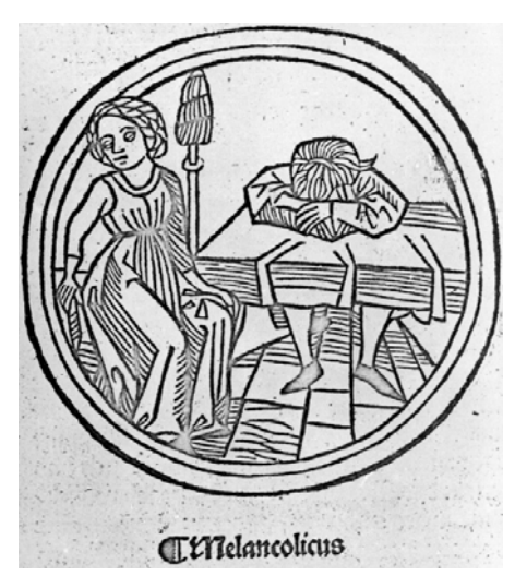
Fig. 4: Augsburg Calendar (Augsburg, bei Blaubirer, 1494): woodcut of slothful melancholy ( melancolia acediosa )