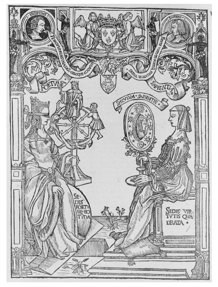
Fig. 2: Charles de Bovelles, Book of the Sage (Liber de Sapiente) , Paris 1510, fol. 116b: Virtue (Virtus) and Fortune (Fortuna), woodcut

partake of both sides of the Virtue-Fortune-antithesis. Just as Dürer's putto, scribbling like a child and thus still of indeterminate and unfinished character, is placed between the two areas, so his melancholy figure reaches into the sphere of Fortune through her contemplation of the heavens.