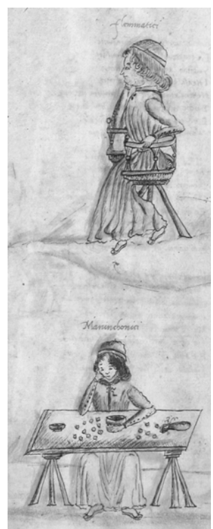
Fig. 7: Lionardo Dati, Sfera , miniatures of the four temperaments (clockwise from top left): choleric, phlegmatic, melancholic, sanguine, Lucca, Biblioteca Governativa, MS 1343, fol. 11b–12a

ancholic temperament, but also – in the direct tradition of Rufus – the paralysis resulting from ceaseless reflection is supported by Dürer's remark in his manual Sustenance for Painter Apprentices (Speis der Malerknaben ). There he says, in a sketch dated 1508, that the young painter should be wary of melancholy prevailing as a result of too much exertion: